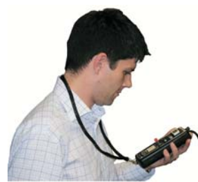
Take the reading