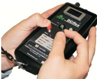
Press the reset button. Null the offset trimmer to zero

The DCflex current probe is simple to use