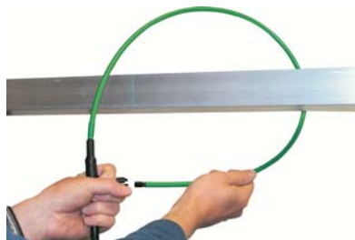
Clip the probe around the dc busbar