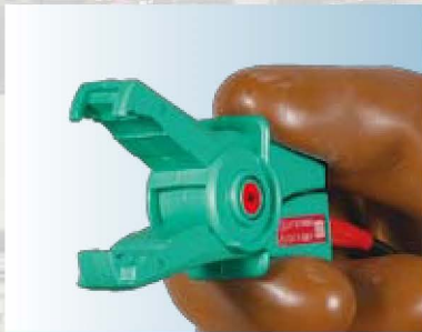
For cables from \phi 2.4 to 30mm

Safe Testing without direct contact with live wires!!