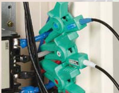
Can clip insulated cables