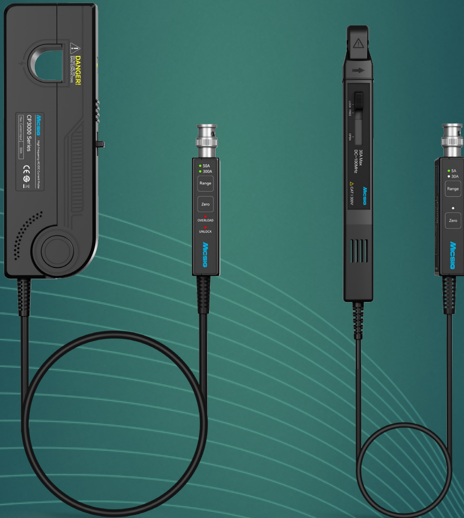
CP3005 / CP3008 / CP1510