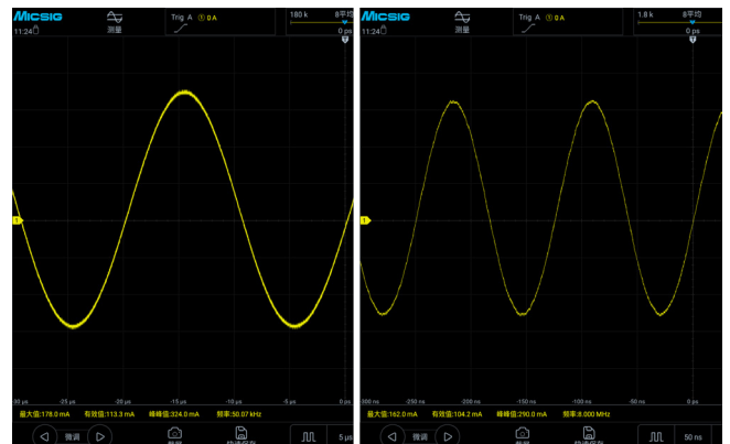
CP3008: Maintains 92% of the original current value when adjusting a 113 mV signal from 50 kHz to 8 MHz, ensuring accuracy in high-frequency measurements.