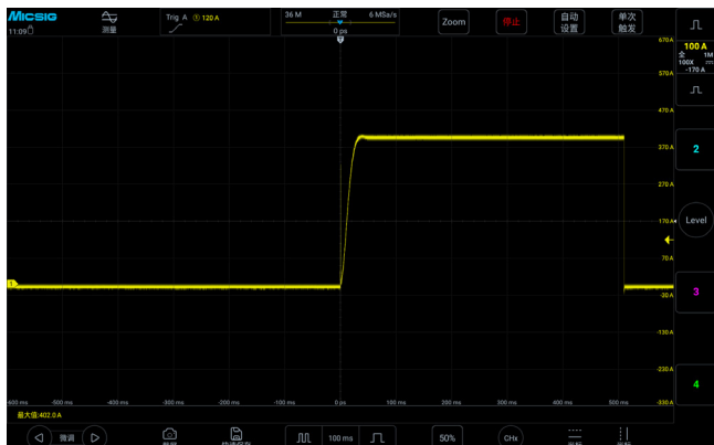
CP3008: Accurate transient capture for 400 A high-current signals.

From milliamps to 300 A rms, the CP Series delivers true-to-form signal reproduction with outstanding transient response — capturing every spike and waveform detail with precision.