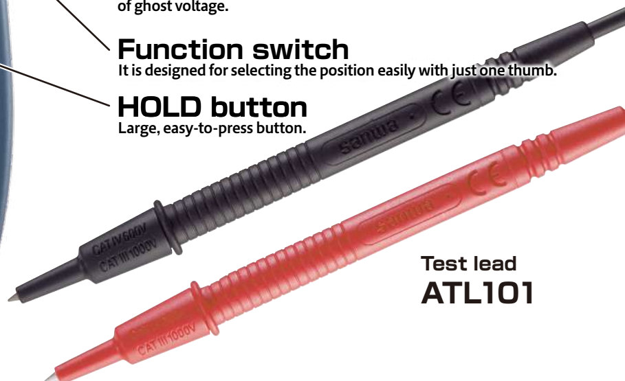
Test lead ATL101