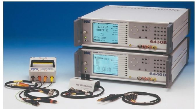
Accurate component analysis to 500 kHz (6430B) or 3 MHz (6440B) is simplified by many accessories which includes Overload Protection Unit 1J1100

The protection unit will protect the test equipment from up to 25 Joules of charged energy.