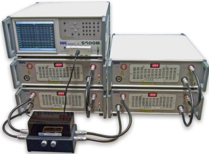
6500 Analyzer with four 6565's and 1027