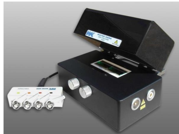
1027 Fixture (40 A)