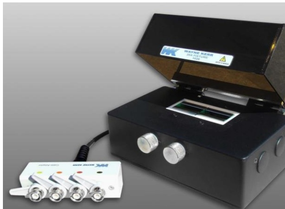
1026 Fixture (20 A)

For use with DC Bias Fixtures 1026 1027 and 1031